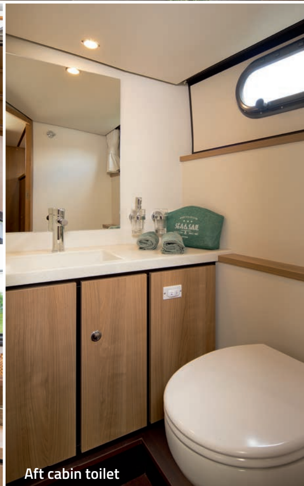
Aft cabin toilet