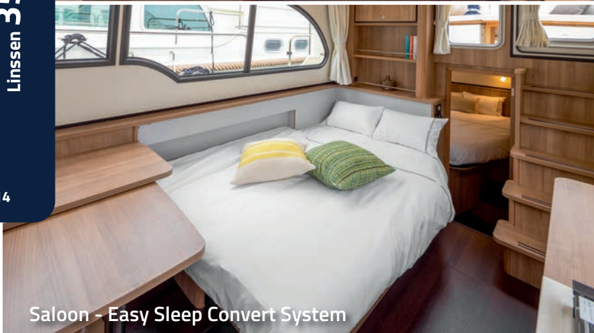
Saloon - Easy Sleep Convert System