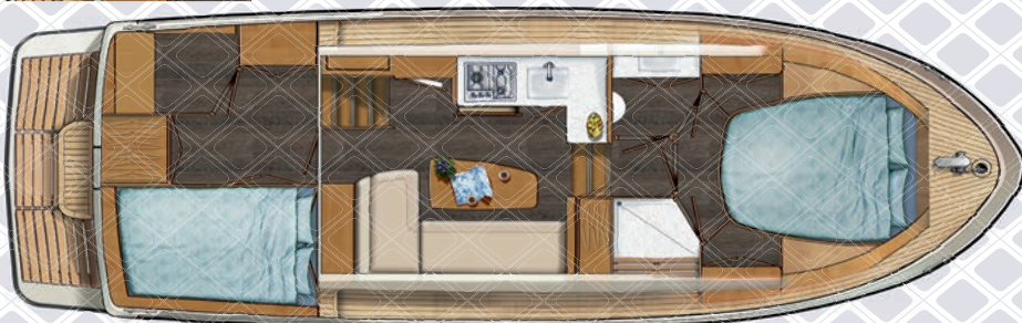
Layout Linssen 30 SL AC