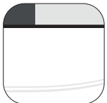
Egg shell White