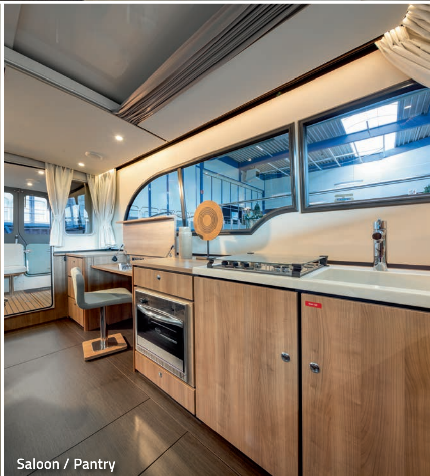
Saloon / Pantry