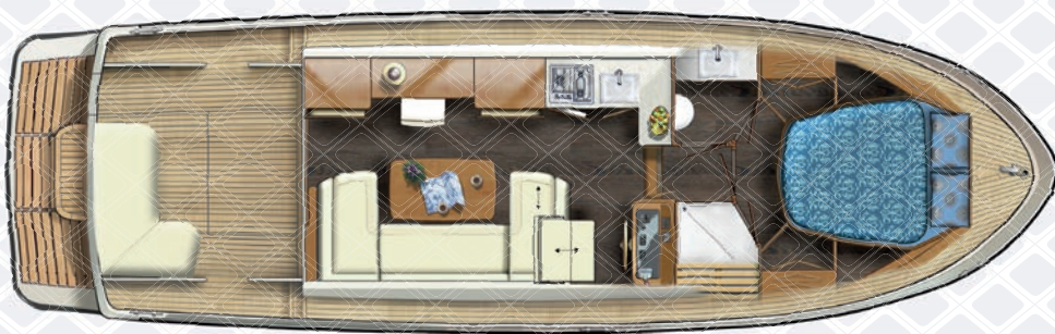
Layout Linssen 35 SL Sedan