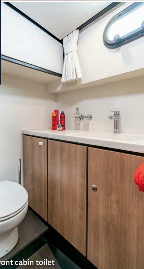
Front cabin toilet