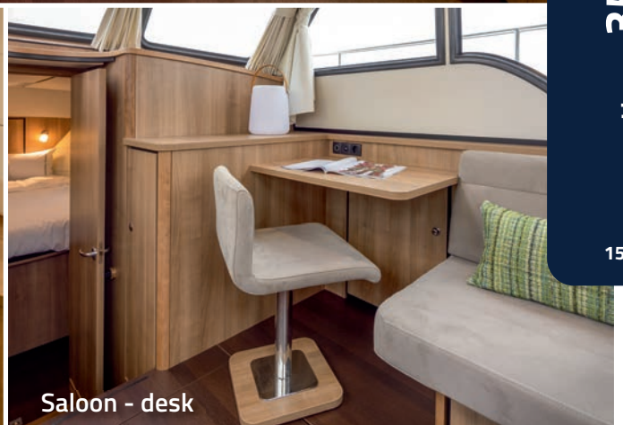
Saloon - desk